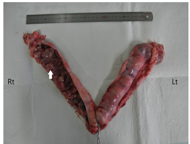
Fig. 3. Gross lesion in the removed uterus. The uterus was enlarged with a uterine horn diameter of approximately 3 cm. The incised right uterine cavity contained a cyst, pus, and blood clots (arrow).